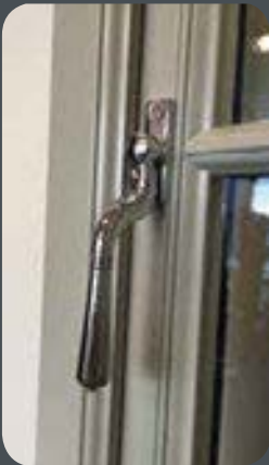
Tear drop handle