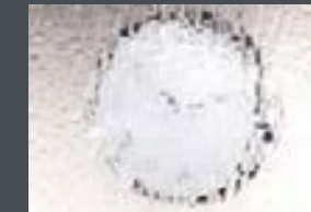
Pilkington Digital Texture Brocade™