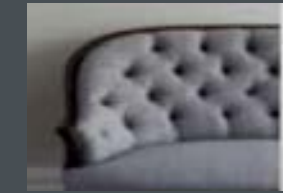
Pilkington Optifloat™ Opal