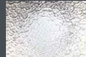
Pilkington Arctic Texture Brocade™