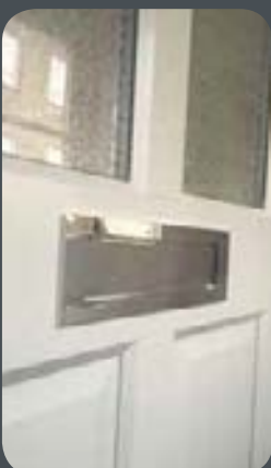
Traditional letter plate