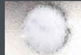
Pilkington Oak Texture Brocade™