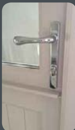
Stella lever handle