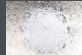
Pilkington Mayflower Texture Brocade™