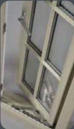
Sash hung on friction hinge