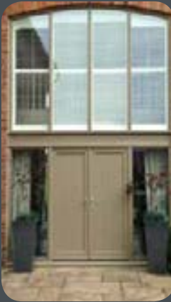
Arched Entrance Screen with Panelled French Doors