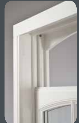
Concealed balance system