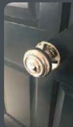
Traditional door knob