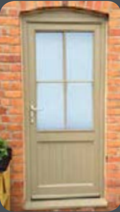
Arched Single Door