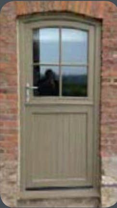
Arched Stable Door