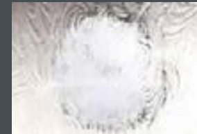
Pilkington Taffeta Texture Brocade™