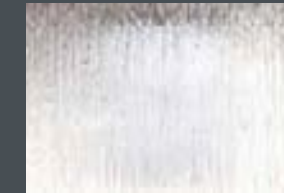
Pilkington Cotswold Texture Brocade™