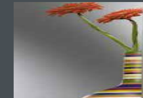
Acid Etched Glass