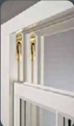
Brass pulley wheels