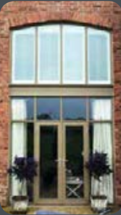
Arched Entrance Screen with Glazed French Doors