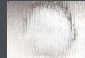
Pilkington Charcoal Texture Brocade™