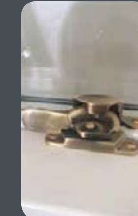
Lockable Fitch catch